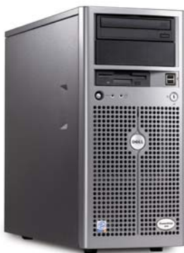
Dell PowerEdge 800

Additionally, the PowerEdge 800 server includes an Integrated Baseboard Management Controller that supports IPMI 1.5 standards. This allows you to conveniently manage the server remotely over network or serial connections with an industry-standard management program. Plus, the DRAC 4/P Management Card provides remote access, monitoring, troubleshooting and repair services independent of the operating system status making the PowerEdge 800 server ideal for remote locations. Moreover, on-site repair is easy. The server includes up to four EasyExchange SCSI hard drives and features a tool-less chassis so you can maintain the system without hassle or complex server knowledge.